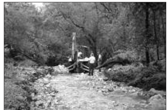
The RGTC construction crew re-buries cable washed out by the heavy rains.

October is Cooperative Month. Your use of co-op services earns you patronage credits that are paid back to you!